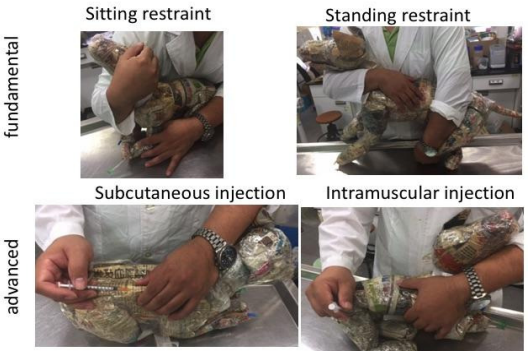
Figure 3. shows these four types of skills.

As volunteer subjects for this study, we recruited 15 first-year veterinary students with no previous experience in clinical courses. Of these students, one group (n=7 students) was each asked to explain how to perform fundamental clinical skills (such as sitting restraint or standing restraint), while the other group (8 students) was each asked to explain the steps of performing advanced clinical skills (such as intramuscular injec-