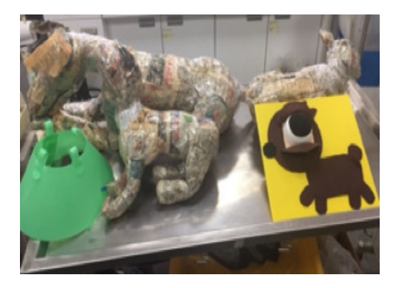
Figure 1. shows the different versions of finished canine manikins.